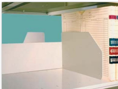
FILE DIVIDERS Removable file dividers are adjustable on 3" centers.