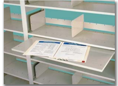
REFERENCE SHELF Handy work surface slides beneath a standard shelf.