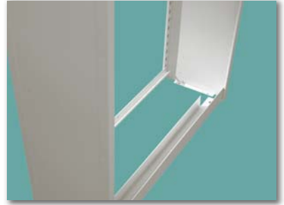
QUIK-BASE™ Quik-Base acts as shelf support, front base and floor anchor all in one.