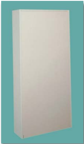
ONE PIECE BACK Clean line with no holes or bolts.