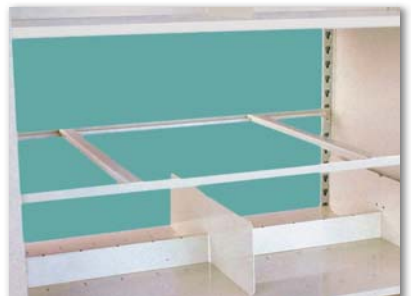
ADJUSTABLE REINFORCEMENTS Prevents deflection of shelf and distributes weight load.