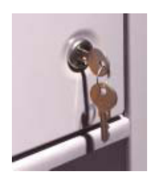
Sleek Contemporary lock Design