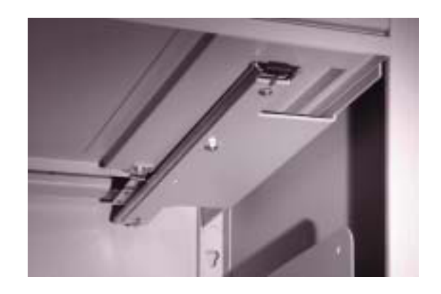
Slide installation is easy. Slides provide smooth door operation.

Franklin Mills Co - Experience is the Difference Phone: 1.888.678.4585